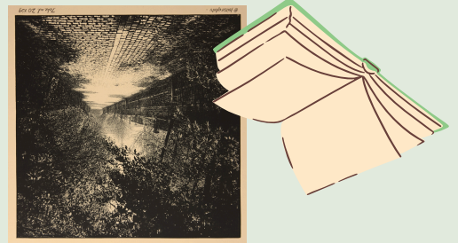
Sunlit Shadows Project