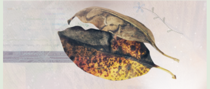
The Com_post Pie_all